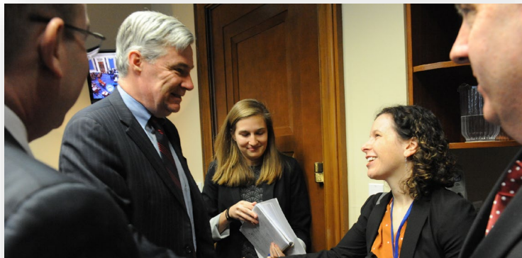
Senator Sheldon Whitehouse (D-RI)

In March, as a part of APA's 2019 Practice Leadership Conference (PLC) in Washington D.C., hundreds of psychologists and psychology graduate students visited nearly 300 Capitol Hill offices to advocate for their profession. Representing their state and territorial psychological associations, conference attendees asked members of Congress to co-sponsor the Medicare Mental Health Access Act (H.R. 884) and the Mental Health Telemedicine Expansion Act (H.R. 6781) .