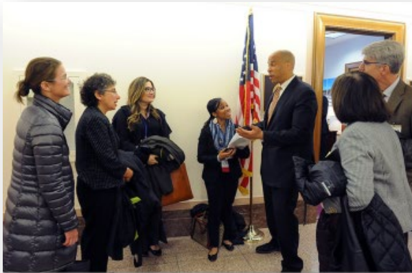
Senator Cory Booker (D-NJ)

The timing of PLC allowed psychologists to weigh in on issues making headlines. Shortly before the conference, news broke that several APA-accredited programs at Argosy University institutions were about to close, stranding doctoral psychology students enrolled in these programs. Conference attendees went to Capitol Hill with information to raise awareness of this issue. Additionally, shortly after the conference, the Trump administration started reattacking the Affordable Care Act (ACA). This was timely as psychologists were just on Capitol Hill talking with their Members of Congress about the importance of the ACA's mental health and substance use disorder coverage. More information regarding Argosy is available here .