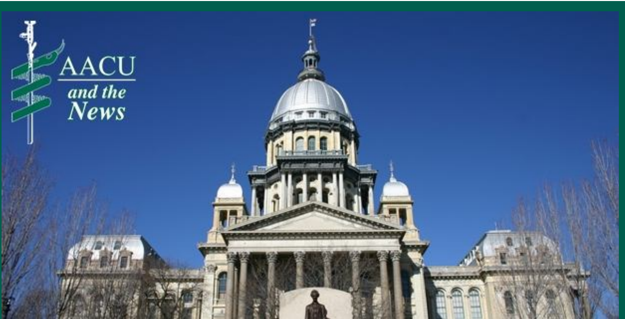
Illinois State Capitol

Viewing this email on a smartphone or tablet? Click here for mobile version.