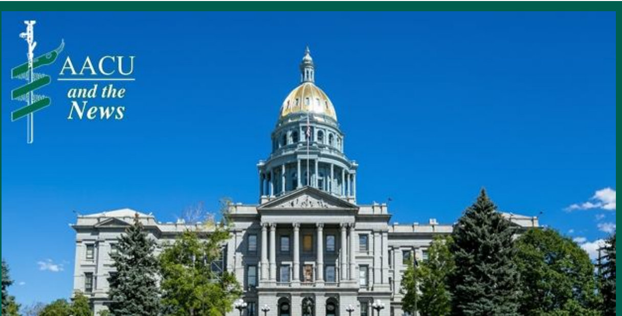
Colorado State Capitol

Viewing this email on a smartphone or tablet? Click here for mobile version.